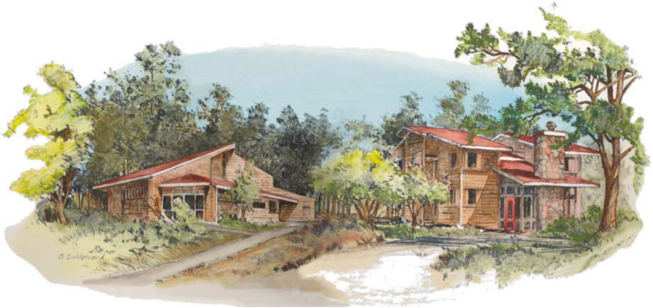
William Penn Mott Jr. Training Center